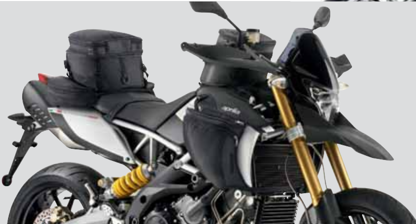
DORSODURO 1200 ATC/ABS APRILIA BLACK

Discover the range of Aprilia accessories at the website www.accessories.aprilia.com